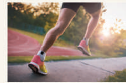
WALKING / JOGGING TRACK