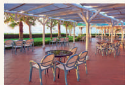
SEATING FOR SOCIALIZE