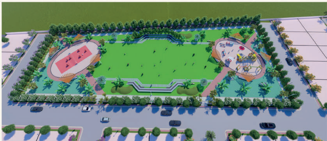
Park Aerial View